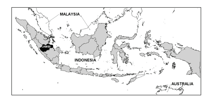
FIGURE 1 Jambi province where Bape village and Bungo district are situated

Within Bungo district dozens of small logging concessions received HPHH permits from the district head. Nevertheless, the district office was unwilling to release details of the locations and extent of the areas in which these concessions were operating. In the vicinity of Bape village, one small logging concession was operating. After receiving the permit from the head of Bungo district in early 2004, the concession established a logging camp in the forest and employed around 50 loggers who came from other part of the island or from Java. Since its inception, there has been dissension between this concession and the community of Bape over the delineation of the forest boundary. The people of Bape perceived the concession area to overlap with their traditional forest.