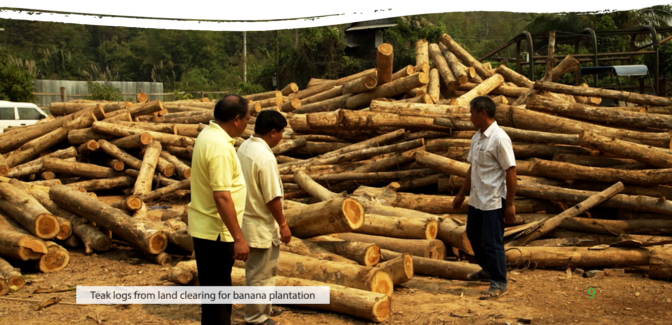
Teak logs from land clearing for banana plantation

RECOFTC-ForInfo, 2013. Teak smallholder plantations . [Lao PDR Factsheet] November 2013. Bangkok: RECOFTC.