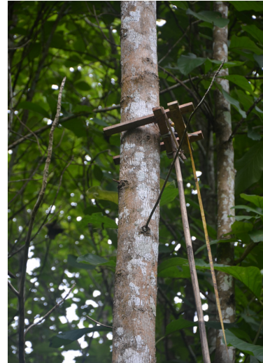
Height measurement of the 10-cm diameter small end of the potential logged tree for the financial valuation